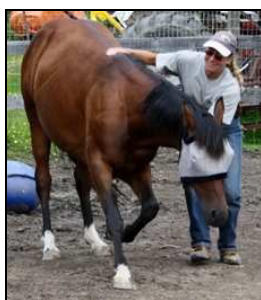
Practising the bow with Fire

Even though the horses enjoy some much deserved time off during the winter months (besides the occasional trail ride or groundwork session), life at Falling Star Ranch isn't exactly boring during the winter months. Between chores, keeping the wood stove going and keeping the snow at bay, Birgit is busy trying to catch up on all the things she didn't have time for between spring and fall. Birgit's plans for this winter are working on a brochure to further promote Falling Star Ranch's mentorship program, updating the Falling Star Ranch website, writing more blog entries (see link below), and editing some video footage that we've taped over the last few months and post them on YouTube and Facebook.