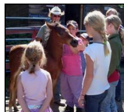
Kids camp at Falling Star Ranch in Dunster

After a very successful first-ever kids camp, Falling Star Ranch is planning to hold one or two horse day camps for kids during the 2009 summer break.